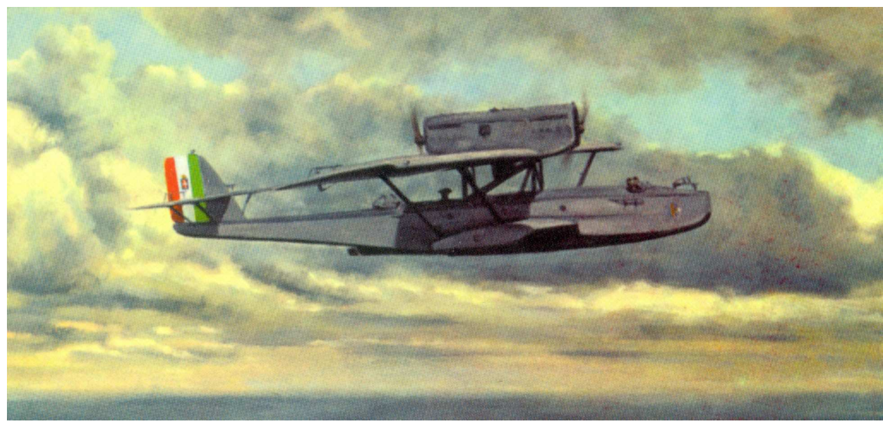
Dornier Wal Showing Sponsons on Bottom of Fuselage.